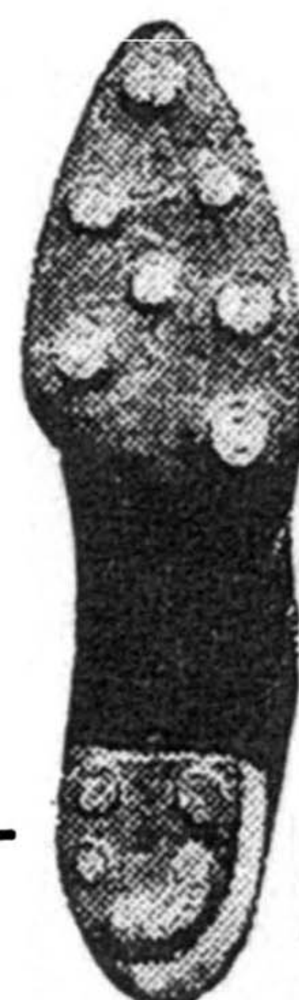
Plugged sole of Scotch oxford golf shoe, for firm stance

A LTHOUGH it has nothing to do with riding, I have illustrated in this issue, an excellent type of shoe for golf. This is a Scotch oxford with a Lorne tongue and a scarfe sole set with plugs, of course, which give a very firm grip on the ground. It is vitally important to have a firm stance and to this the shoe — properly designed — contributes very greatly. A rather interesting high golf shoe now on the market, which I shall illustrate in a later issue, incorporates a special feature at the instep which permits the player to turn very freely without moving his foot. This is a feature which will be appreciated by those who like to wear golf shoes of ankle height but who dislike the stiffness at the ankle which is frequently found in them. Perfect freedom of movement during the course of the swing contributes much to the success of one's game.